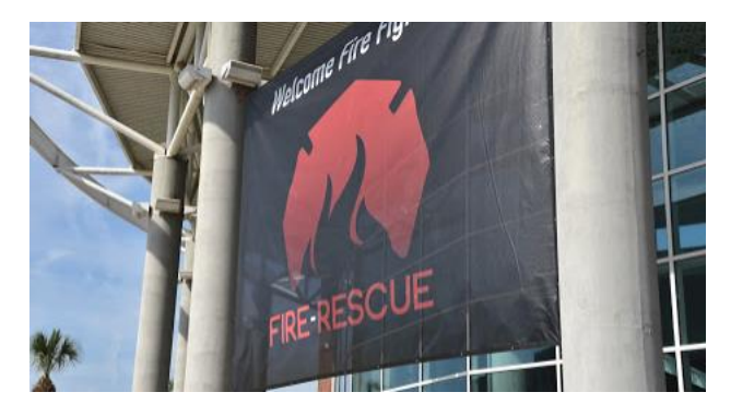
The South Carolina State Firefighters' Association is open to other sponsorship opportunities. If you are interested in being a sponsor but don't see an option listed that you are interested in, reach out to our staff and we will be happy to discuss other opportunities that may be available and that will fit your budget.

We have many opportunities to display your logo around the conference center during Fire – Rescue Conference. If you are interested in having your logo displayed, please contact our office for options.